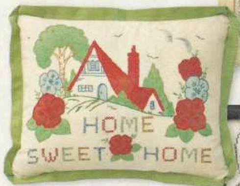
1 "Home Sweet Home" was often the first motto a person stitched. This 1931-32 pillow's background came preprinted, then the crafter stitched the outline and motto. Valued at $75.

Carter sells her motto samplers from $60 to $150. The quality of linen, scarcity of motto or pattern, and intricacy of stitching affect the value of samplers. Look out for spots, stains, and yellowing, although samplers can be cleaned. Carter removes her samplers from the frame, soaks them in soap and water overnight, then rinses and lightly irons.