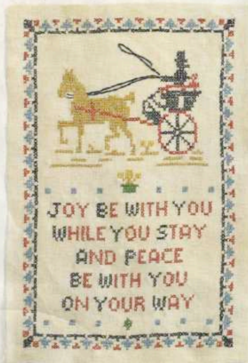
3 This 1928-29 sampler has a very common verse; however, the carriage and horse, rather than an expected cottage scene, places it at $110.