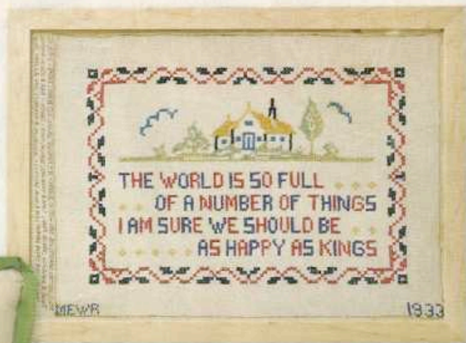
4 This newly framed linen sampler's $135 price tag is justified by the rare motto, signature, date, and intact directions. That's a bargain given its many hard-to-find characteristics.